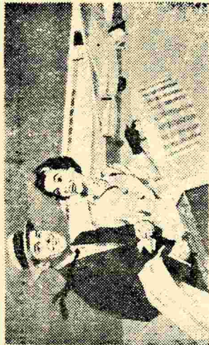
MONEY FOR TRIPS AND VACATIONS