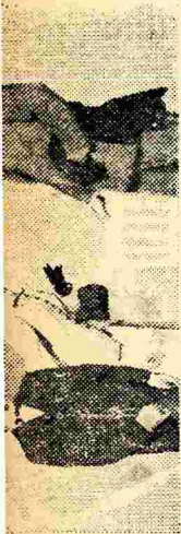
MONEY FOR FAMILY NEEDS